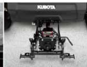
4 point hitch