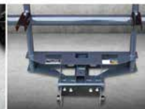
Front grill adaptor kit